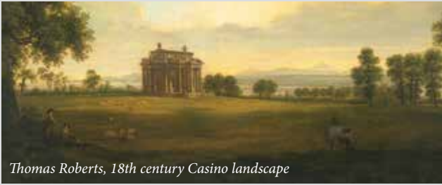
Thomas Roberts, 18th century Casino landscape